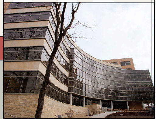
The UW Medical Foundation Centennial Building, new home of the Department of Urology.