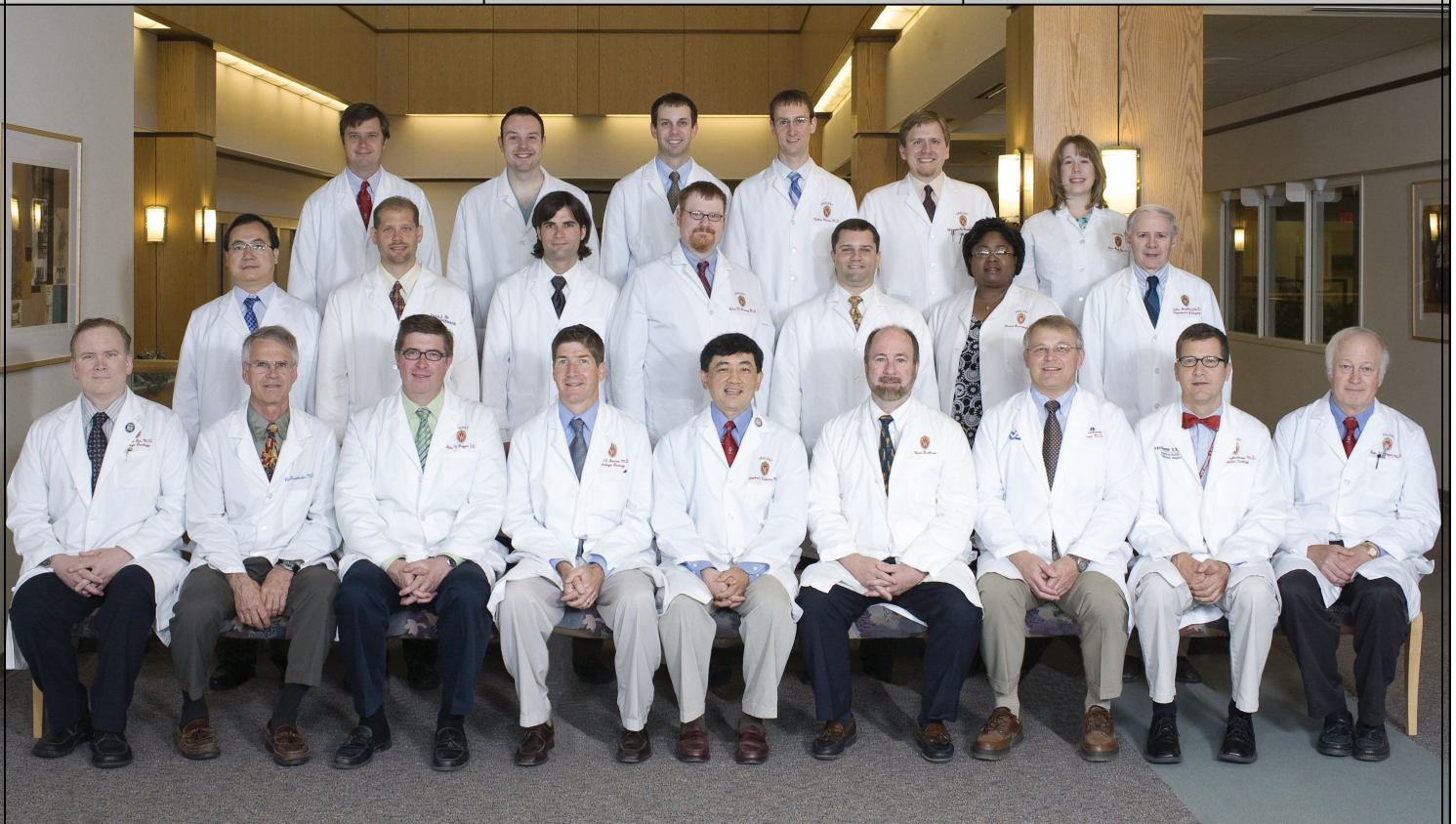
UW UROLOGY 2008 FACULTY AND RESIDENTS