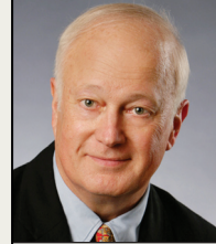
JOHN WEGENKE, MD CLINICAL PROFESSOR

With increasing age, men and women experience an increase in urinary tract symptoms. These symptoms may be divided into obstructive symptoms (for example, hesitancy, weak stream, intermittency) due to bladder outlet obstruction, or irritative symptoms (for example, frequency, urgency, incontinence) due to overactive bladder. Overactive bladder is more common in men than women of the same age. Fifty percent of men with bladder outlet obstruction have symptoms of overactive bladder.