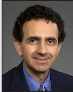
Anthony Atala, MD

Professor & Chairman, Department of Urology Director, Institute for Regenerative Medicine Wake Forest University School of Medicine Winston-Salem, NC